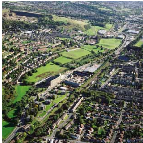
Shipley Canal Road Corridor

5.3.59 The only exceptions are Bradford City Centre and the Shipley Canal Road Corridor. Within the City Centre the housing targets to an extent reflect permissions already granted together with further ongoing viability work to suggest the levels of new homes that could reasonably be accommodated in the two key regeneration areas. The Council has also taken account of the balance in sustainability terms of locating development within the Regional City with its access to services, infrastructure and public transport compared to increasing further the levels of development in lower order settlements. The presence of environmental constraints such as possible impacts on the South Pennine Moors SAC / SPA has also